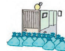
Simple water bags made from trash bags