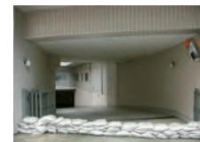
Sandbags and water bags