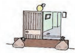
A simple waterstop setup

※ Some wards have sandbag preparation stations. Please inquire with your ward office for details.