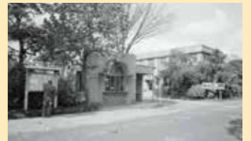
Gate house (1962)

① Gate house Constructed as a front entrance in 1925.