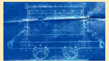
Cart design (1920)

⑤ Motor room for incline There was a machine installed to lift minecarts loaded with soil and sand that had been removed from sewage, up to the top of the hill.