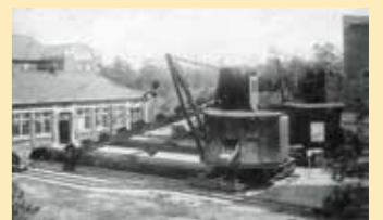
Original grit chamber

③ Grit chamber There are two ponds, east one and west one. As sewage flows slowly through a pond, sand and grit are settled out.