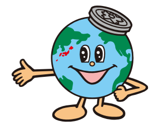
Earth-kun, the mascot of Bureau of Sewerage